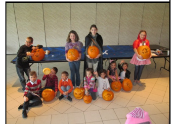
Everybody had fun.