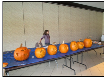
Pretty little pumpkins all in a row.