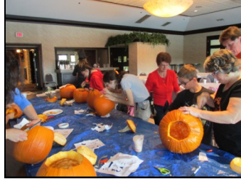
Everybody hard at work